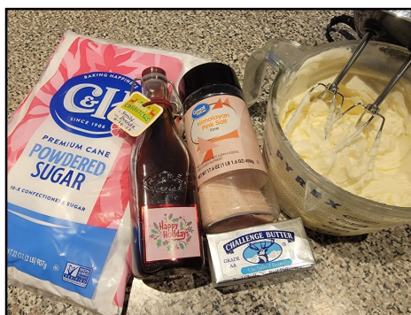
Frosting ingredients, including my sister's homemade vanilla extract.