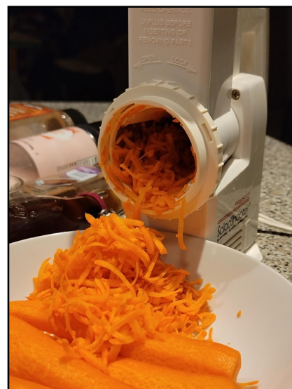
Presto Salad Shooter does the trick with the carrots!