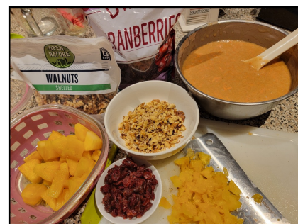
My "go-to" cake add ins.