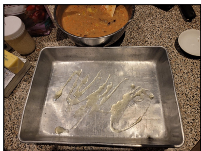
Coat the cake pan with a thin layer of sunflower oil and dust with flour.